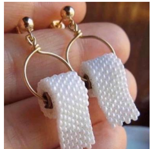
2020 Commemorative Earrings

Call Beth at 814 880 3039 to arrange to pick up your special donation to guild service projects!