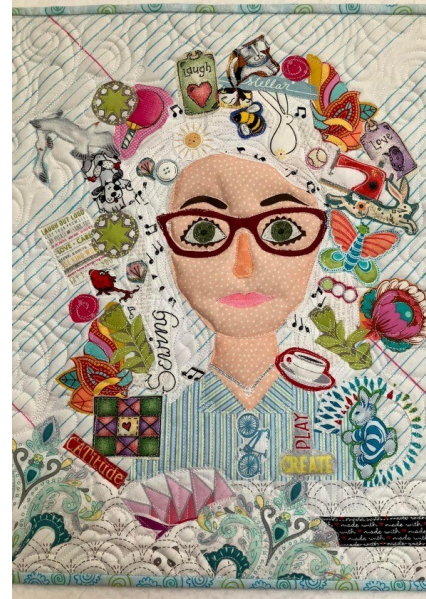
This is one unknown person's very fun and literal interpretation of the theme. However, there are so many ways to tell the story of who you are. Have fun!

A smaller, wall-size quilt no larger than 24” x 24”